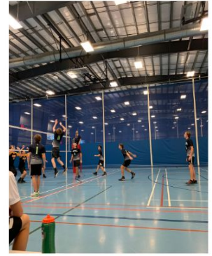
SR. HIGH BOYS VOLLEYBALL ZONES